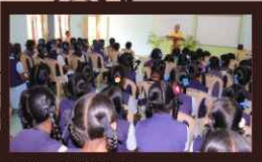
Creating Great Students Forum