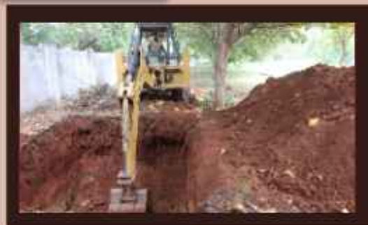
Swachh Bharat Date: 03.10.2023