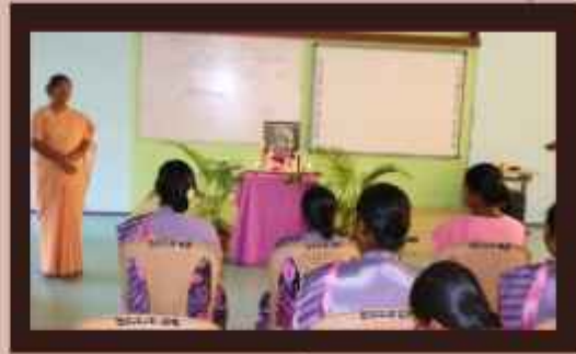
Freedom Fighters Remembrance Day