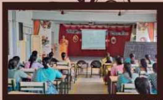
Seminar on Community Survey Date: 26.10.2023