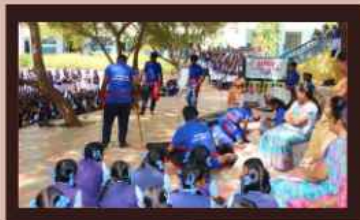
AICUF Program on Democracy Today