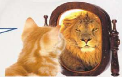
SELF - ESTEEM