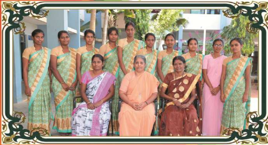
Maths, Tamil & CS Department